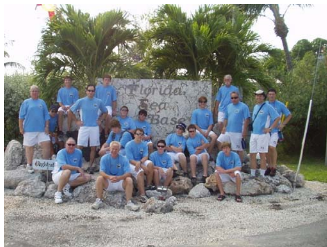
YYYYAAAAARRRRRR me hearties!!